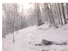
Pine Hill Trail