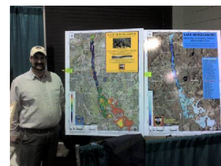
View of new large Mural Maps