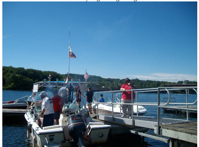
Crews stopping by for our year-end cookout