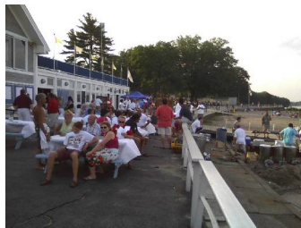
Cookout on the beach draws a crowd

On Saturday, July 17 th , Regatta Point Community Sailing has its 50 th Anniversary Gala celebration. We were honored to be invited to this event, and we donate some Maps of Lake Quinsigamond to be raffled off. All the proceeds of the Fund-Raiser went to support the RPSC and its youth programs.